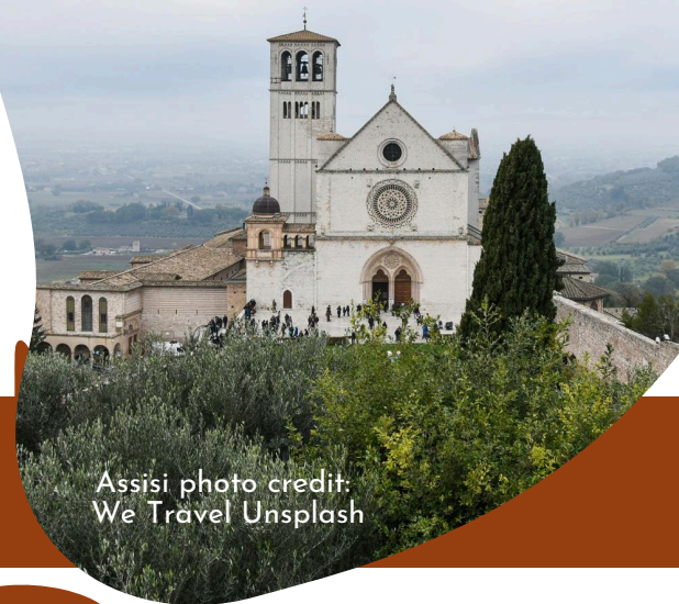
Assisi